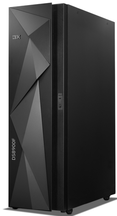
IBM DS8900F all-flash storage system

More than 85% of enterprises around the world now operate in hybrid multicloud environments, and in the next few years nearly all will move to these architectures. 1 At the same time, many of the world's leading industries rely on mainframes as the backbone of their IT and data processing infrastructure. Mainframes are a major driver of worldwide commerce, including banking, airlines, credit card processing, and retail operations. 2